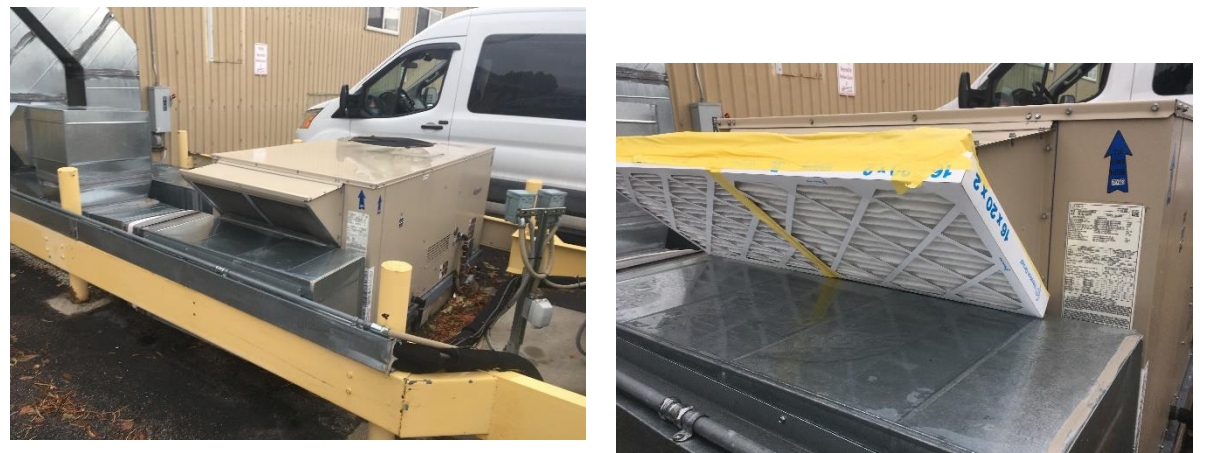
Figure 4. Picture of a MERV 13 filter installed on an outdoor air intake

5. Supplemental Filtration. During a smoke event, add additional filtration at the intake air vent where possible. Figure 4 shows a MERV 13 filter installed on an intake air vent. A minimum of a MERV 13 filter on the outdoor air intakes will capture a large fraction of the PM<sub>2.5</sub>. Prior to fire season, inspect the air intake and make a list of filters (including the specific quantity and size of the filters), tape, temporary ducting materials and other items needed to mount filters to the air intake with minimal bypass around the filter (include these items in a list of Smoke Preparation Supplies, above). Ensure that proper installation instructions have been developed and are up to date. A filter with activated carbon may help control odors and the gases that cause them. Consult a licensed HVAC design professional to prescribe the right filter for your system. Consider having a contractor install permanent filter racks on the outdoor air intake.