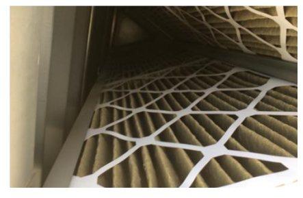
Figure 3. Picture comparing a clean filter to a filter heavily loaded with wildfire smoke.

installed correctly. Well maintained equipment with known operating conditions is critical to providing good indoor air quality. See Section 2.1 HVAC checklist and Section 2.2 Special Note on Economizers, below.