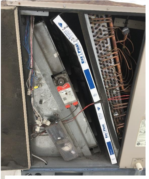
Figure 6. Picture of filter not seated correctly.

recirculation and a small number used to provide filtered outdoor air?