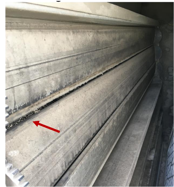
Figure 5. Picture of a warped damper blade unable to close.